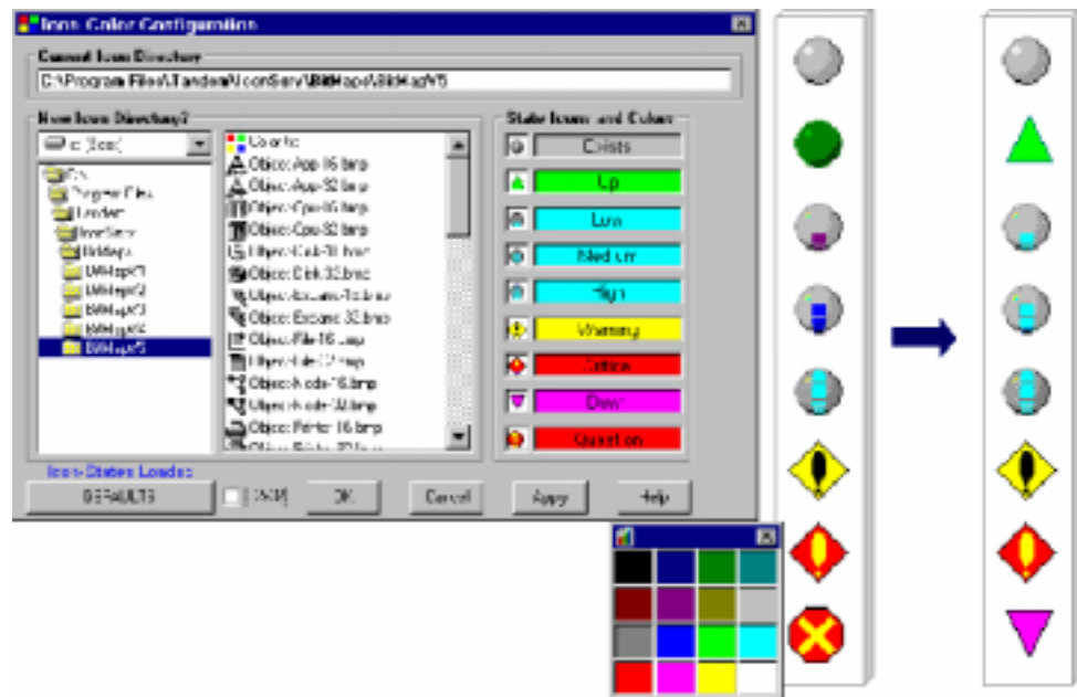
Figure 3. Window illustrating the customizable user-defined states that the ASAP analysis engine can assign to objects.

ASAP software also allows customization of the presentation of an object's availability state. The user-defined icons and colors also address internationalization (see figure 3).